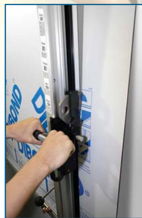
Cut up to 4mm Dibond in one pass with ease, leaving clean, finished edges every time.