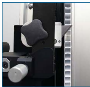
Fletcher-designed extended life blade provides hundreds of cuts in a wide variety of materials with flawless performance.

A surprisingly affordable cutting solution, the FSC is simply one of those products you must see to believe.