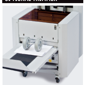
An optional face trimmer trims booklets up to 100 pages.*