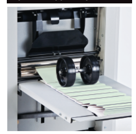
A powered exit conveyor stacks booklets neatly and folds away for compact storage.