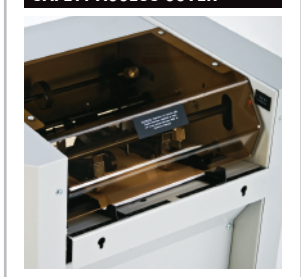
The transparent safety access cover will not allow machine to operate when open.