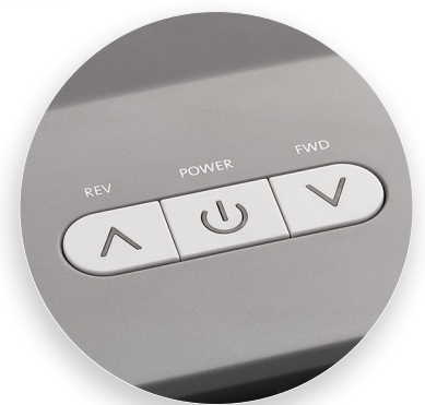
Convenient, easy-to-use controls for simple operation.