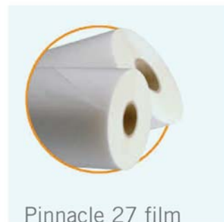
Pinnacle 27 film

High quality and crystal clear laminating film insures the finest results.