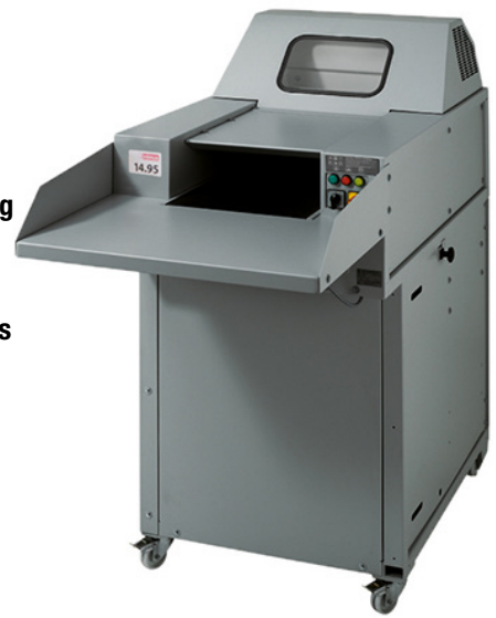
W/D/H 80/120 x 168 x 164 cm

The spacious feed table with integrated infeed conveyor belt provides controlled, effortless, safe and fast loading. The shredded material is collected in large-scale, mobile or swing-out containers under the cutting mechanism. The shred-press combinations are coupled to a baler for immediate fully automatic compaction of the cut material into compact bales. Reduction effect compared to the loose collection of the cuttings is about 70%.