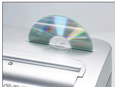
Multi+Media- This machine easily shreds CD's, credit cards, paper clips and staples.