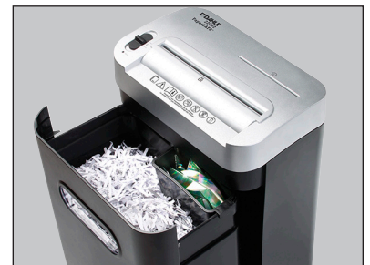
Easy to empty waste bin- Pull open front to empty multi+media container or shred bin.