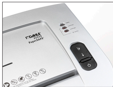
Easy to Operate - LED indicators and push button controls allow for easy operation.