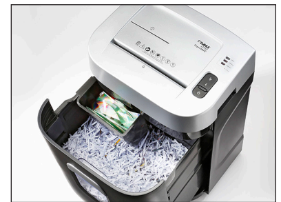
Easy to empty waste bin - Pull open front to empty multi+media container or shred bin.