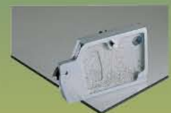
Pillar Post for scoring plastics, acrylics and other "fracture" sensitive materials up to 1/4" (6mm) thick.