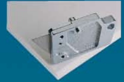
Pillar Post for cutting gatorfoam, foamboard and matboard up to 1/2" (12mm) thick.

For complete purchase package information visit our website at www.fletcher-terry.com