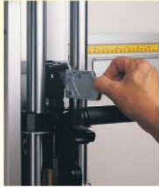
Unique "Pillar Post" design provides quick blade changes for multi-material cutting.