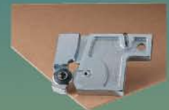
Pillar Post for cutting hardboard up to 3/32" (3mm) thick. Cuts from both the front and back.