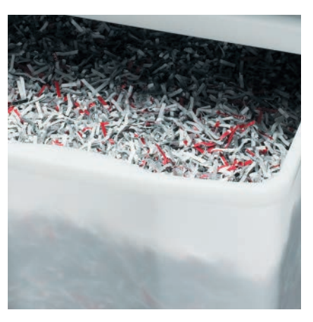
ENVIRONMENTALLY FRIENDLY BIN

An electronically controlled, transparent safety shield protects the operator from stray splinters of plastic.