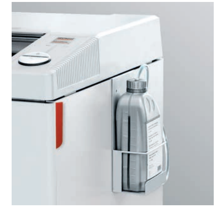
AUTOMATIC OIL INJECTION

Patented Electronic Capacity Control (ECC) indicator monitors sheet capacity levels during operation to prevent jams.