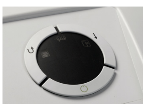
The easy-to-use command dial controls all of the shredder's functions such as power up, reverse, and continuous run.