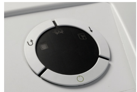
The easy-to-use command dial controls all of the shredder's functions such as power up, reverse, and continuous run.