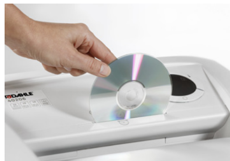
Dahle Office shredder with built in user-friendly opening for CD/DVD destruction.