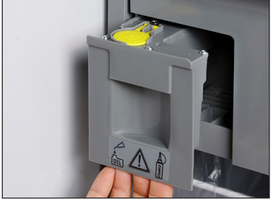
EvenFlow Lubricator evenly oils the cutting cylinders to ensure peak performance.