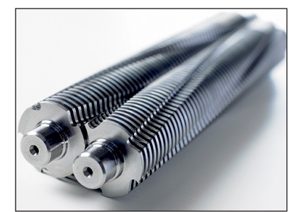
The cutting cylinders are milled from a solid bar of German Solingen steel for strength.