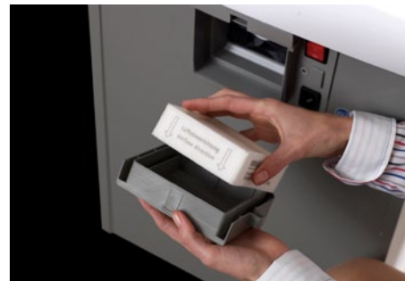
The DAHLE CleanTEC® filter traps up to 98% of the fine dust and provides a healthier work environment.