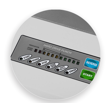
LED keypad with easy-to-use controls for simple operation.