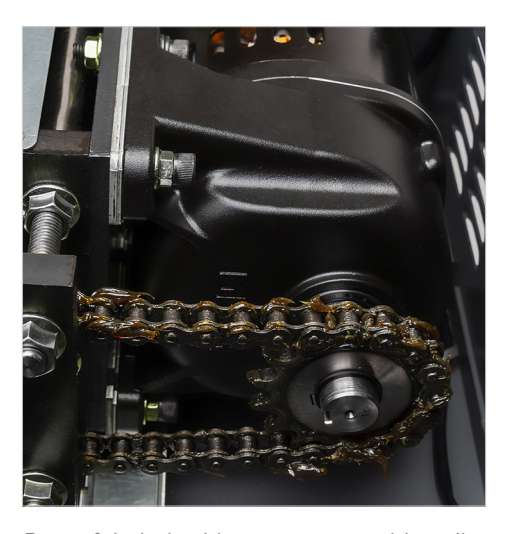
Powerful chain-driven motor provides slipfree performance.