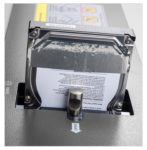
A nickel-plated punch drives a hole through media, rendering them unreadable.