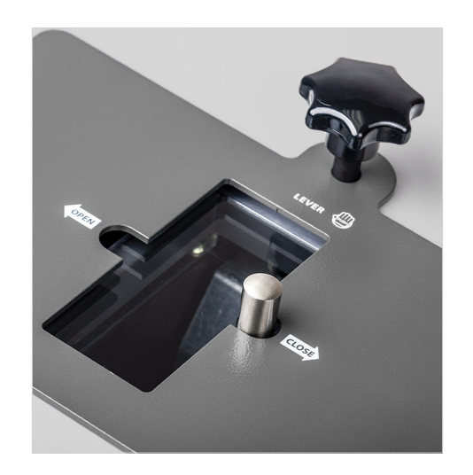
Chute has transparent safety cover that will automatically stop machine if opened.