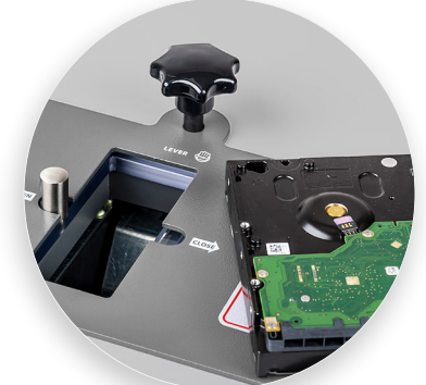
NSA Approved for the destruction of hard drives for complete security.