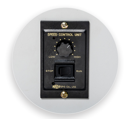
Control the speed of the conveyor belt with the turn of a dial.