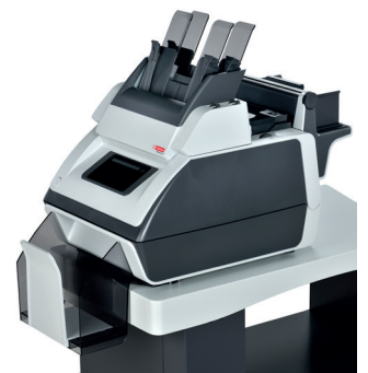
TSI-2.5 S 2.5 STATIONS