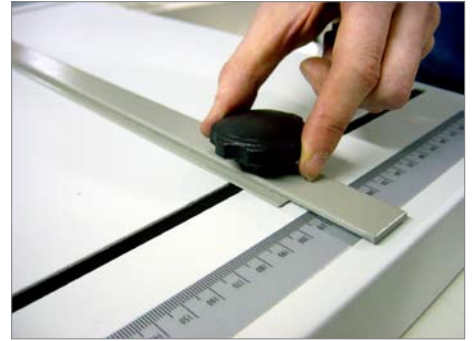
Positioning is fast and easy with measurement scale.