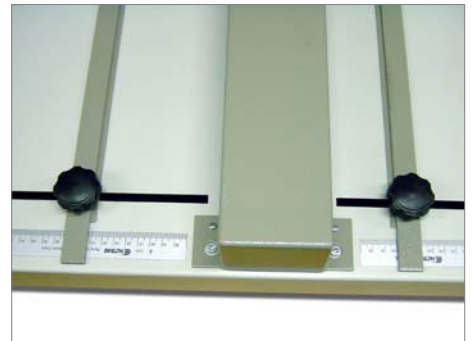
Two alignment bars.