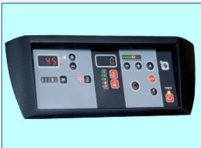
Digital Control Panel