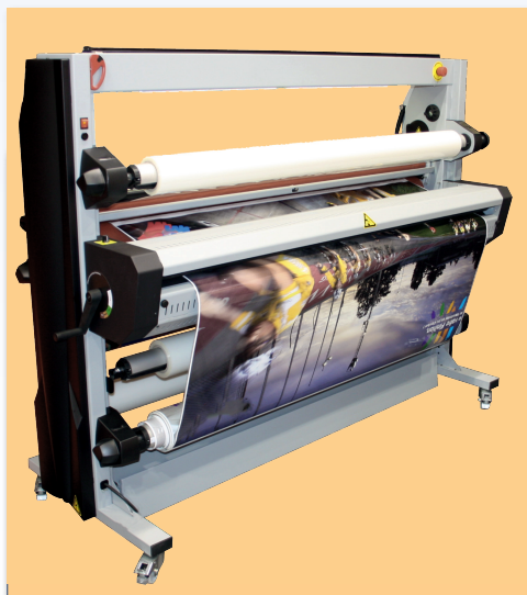
Rear Takeup for Roll-to-Roll Lamination