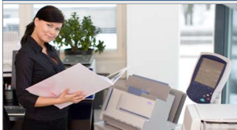
Fastbind BooXTer Duo™ can be combined with Fastbind Casematic H32 Pro™ for the best printed hard cover books, photo albums and company presentations.