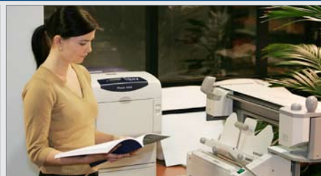
With Fastbind Elite™ perfect binding machine anyone can bind professional quality books and reports.