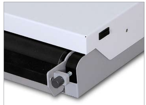
The integrated edge folding unit is adjustable for different cover board thicknesses.