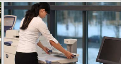
With Fastbind FotoMount F32™ manual photobook maker you can create a beautiful and professional photobook yourself. The finished book opens astonishing 180 degrees.