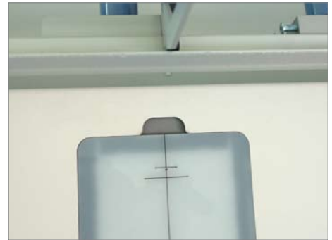
Registration marks for thicker and thinner materials offer you more versatility in applications.