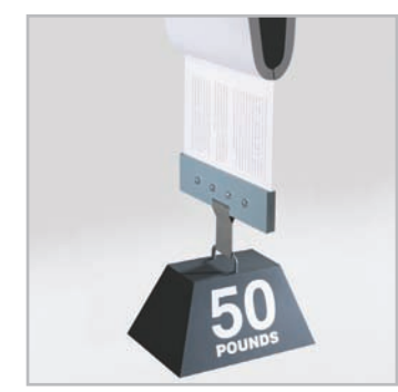
Super strong bind

The FB20 is the ideal binding machine for all corporations, financial institutions, copy shops, print environments, or education establishments that require professional-looking presentations, yearbooks or bound documents at a fraction of the time required to bind with alternative binding solutions such as coil, comb, or wire. This machine offers unprecedented ease of use with its LCD display that guides the user through each operation using animated illustrations. The Fastback 20 works with all of the Powis binding materials, from the versatile Super Strip to the customized Image Strip to the Perfectback strips for perfect binding books. It can create anything from a simple report to a 350-sheet hard cover book.