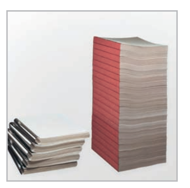
3.5 times faster than punch-and-bind