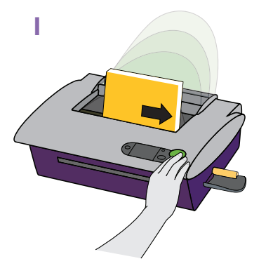
Prepare book block, place into machine and press the green button.