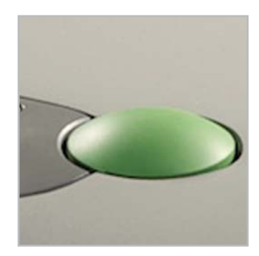
One Touch Function

The FB20 is the ideal binding machine for all corporations, financial institutions, copy shops, print environments, or education establishments that require professional-looking presentations, yearbooks or bound documents at a fraction of the time required to bind with alternative binding solutions such as coil, comb, or wire. This machine offers unprecedented ease of use with its LCD display that guides the user through each operation using animated illustrations. The Fastback 20 works with all of the Powis binding materials, from the versatile Super Strip to the customized Image Strip to the Perfectback strips for perfect binding books. It can create anything from a simple report to a 350-sheet hard cover book.