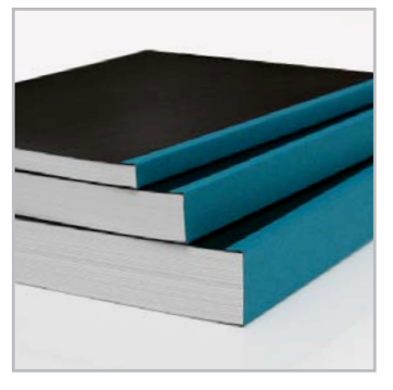
3 different strip widths for binding from 10-350 sheets