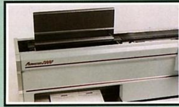
Immediately, the pad is done, ready to use and it slides onto the delivery chute automatically.