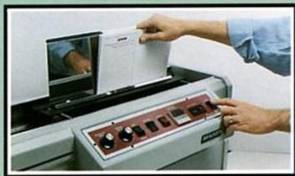
You place loose sheets (or pad strips) into PadMaster 2000 and push cycle button.