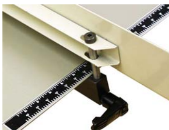
Quick-Lock & Micro Adjust Side Guides for Fast Setups