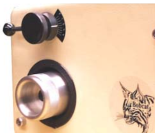
Pitch Depth Control & Safety Hand Wheel