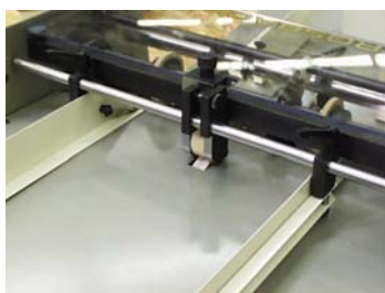
Positive Feeding Caliper