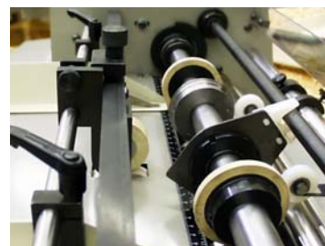
Standard Precision Rosback Heads