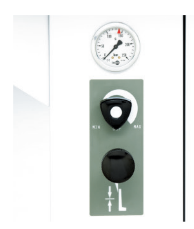
ADJUSTABLE HYDRAULIC CLAMP Clamping pressure is fully adjustable between 1,900 and 3,800 psi.