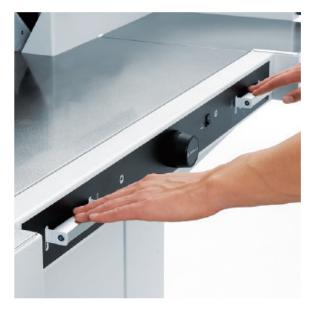
EASY CUT BLADE ACTIVATION BARS Patented EASY CUT blade activation bars ensure true, two-hand operation and allow blade and clamp to be activated independently.