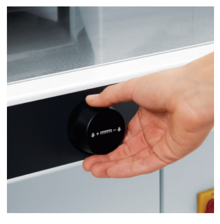
ELECTRONIC HAND WHEEL The electronic hand wheel, with infinitely variable speed control, is used for manual back gauge positioning.