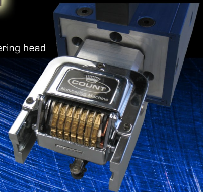
1 Gothic (7) wheel reverse numbering head Standard.

Count Machinery Company 2128 Auto Park Way Escondido, CA 92029 Phone 760-489-1400 Fax 760-489-1543 info@countmachinery.com www.countmachinery.com