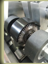
Linear Perforating Standard