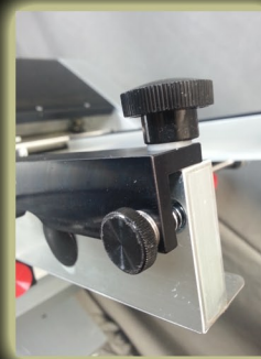
Microlateral for easy skew adjustments